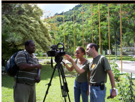
Students learn hands on in CMP 101

While on the Campus of the University of Southern Caribbean in Trinidad in 2007 to tape the 2nd quarter 2008 edition of Mission: SONlight , Network 7 was invited to return to teach during the annual summer fine arts classes they provide their community. Over one hundred participants attended various classes. During Christian Media Production 101, an intensive 2 week course,